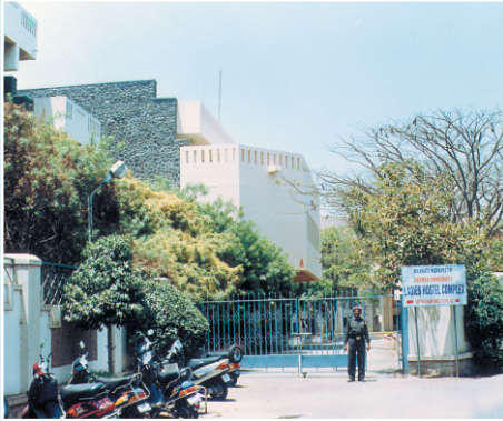
Ladies Hostel (A)