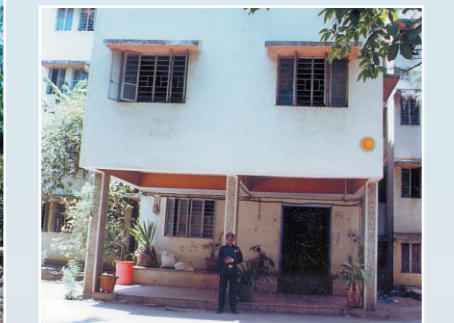
Ladies Hostel (C)