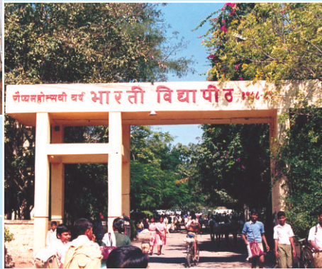
Erandawane Campus Gate