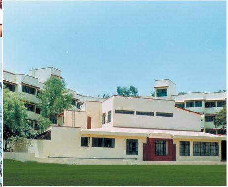
Boys Hostel (D)