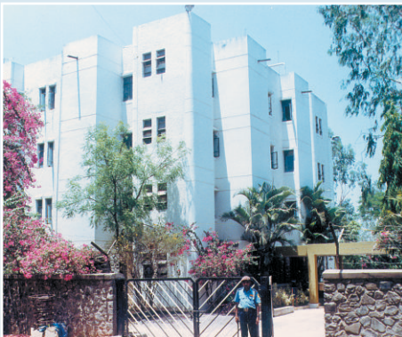
Ladies Hostel (E)